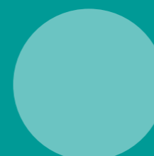
Vacant Cheshire West and Chester Council