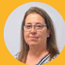
Angela Black Until October 2026