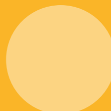
Patricia Hayes Until September 2024